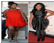
Celebrity Weight-Loss ...