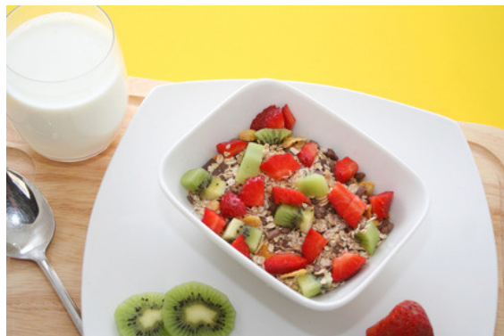
Post Workout Meal for Weight Loss