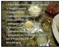
Healthy Weight Loss (Meals)... "Baked Fish, Tomato & Onions"