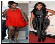
Celebrity Weight-Loss ...