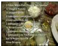
Healthy Weight Loss (Meals)... "Baked Fish, Tomato & Onions"